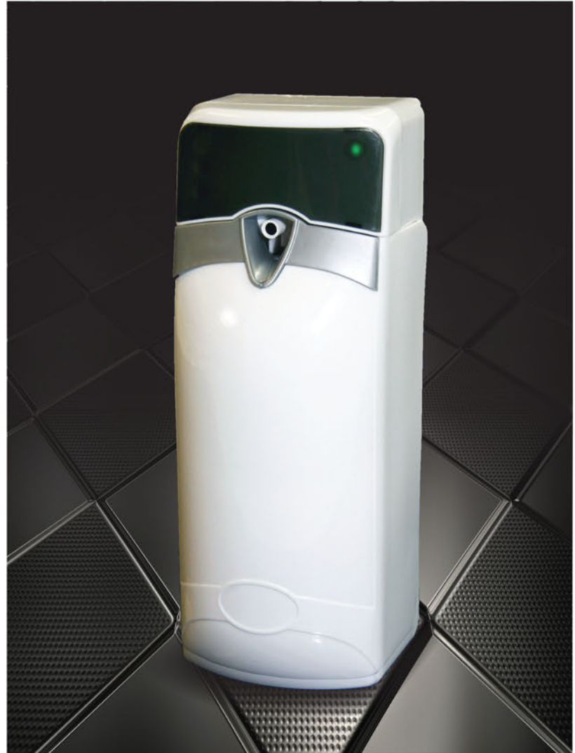
Metered Aerosol Dispenser