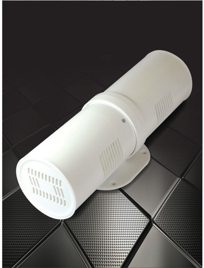
Wide-Area Dual Fan Dispenser