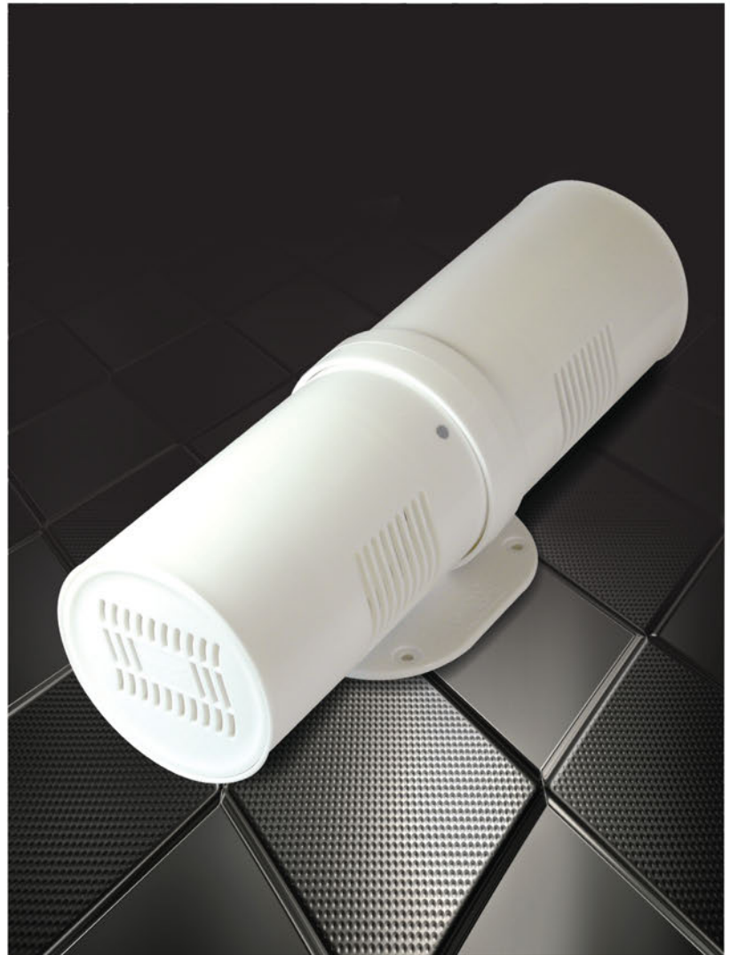
Wide-Area Dual Fan Dispenser